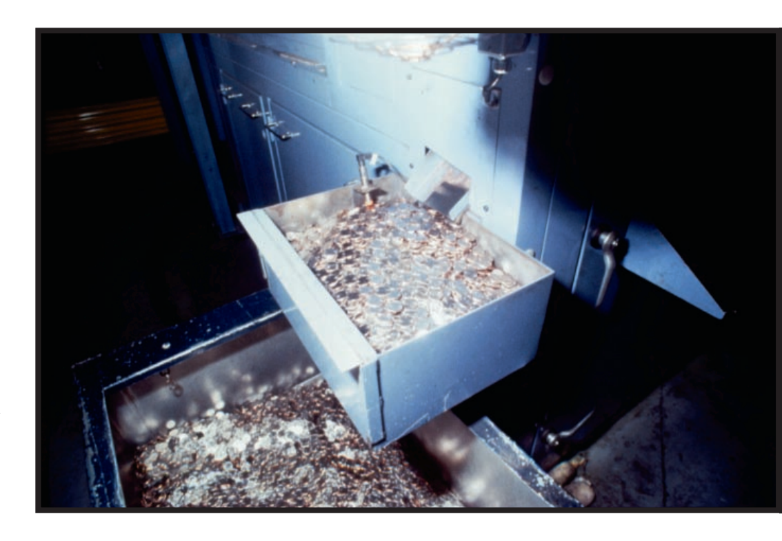
Dimes, after being checked for size, ready for counting and bagging.